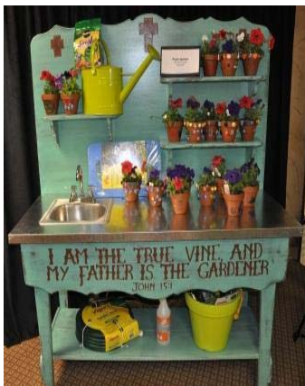
Mrs. Schwab's 3rd Grade Class

All of the class projects are available for purchase online. Visit the online auction to bid on your favorites!